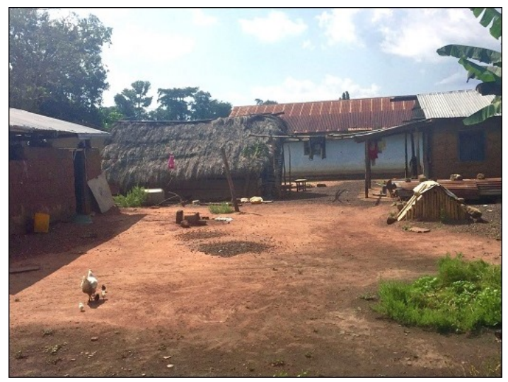
(http://www.earthintransition.org/wp-content/uploads/2017/05/tafi-15b.jpg) In 1993, a number of organizations, including the Peace Corps in Ghana, the Nature