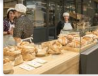
FICO Eataly World – A Foodie Heaven in Bologna