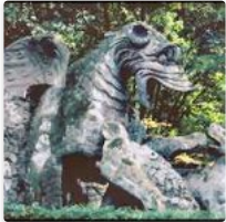
Bomarzo, Italy's Park of Monsters