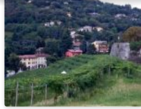
Brescia, the Lion Queen of Italy