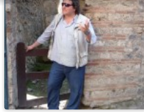
Hiring a Tour Guide: Is it Worth it?