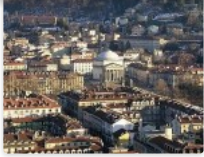
Where to Stay in Turin