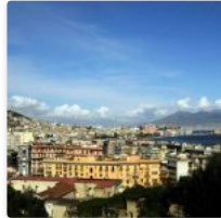
Italy From Bottom to Top: Arriving in Naples