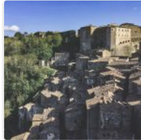
Enchantments in the "Etruscan triangle" of Southern Tuscany