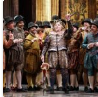
La Scala: More Than Just a Night at the Opera